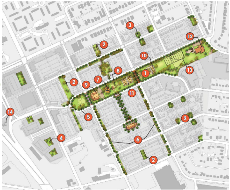
Exhibit 3-7: Open Space Plan