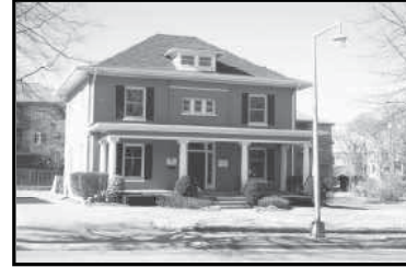
To maintain existing character, the height of new buildings in Sub-districts 1B, 2A and 2B should be capped below 3 stories.