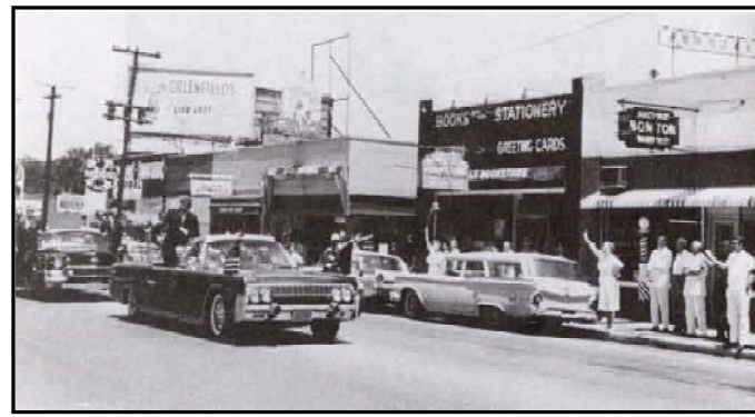
Source: HOME PLACE: A History of the Hillsboro-West End Neighborhood Nashville, Tennessee