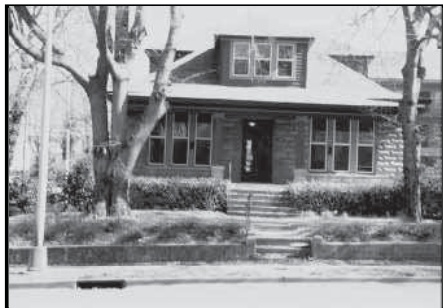
Future development in Sub-District 2A should look to this residential building for inspiration.