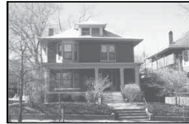
Within those portions of the Village featuring residential buildings, a maximum building width requirement will be the key massing control.