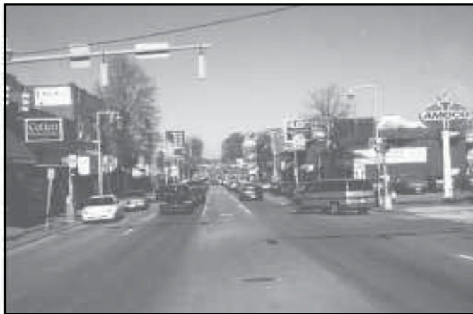
Hillsboro Village 1999