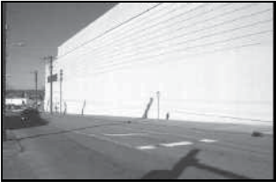
Box-like buildings having long uninterrupted facades with few window openings and recesses/projections fail to achieve a human scale and visual relief.