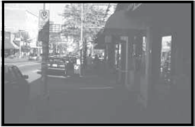
The inviting storefronts, comfortable pedestrian environment, and design cohesiveness in the commercial core have contributed to the recent popularity of the Village.