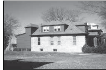
This low pitched, hipped roof with dormer windows is characteristic of American Foursquares and bungalows.