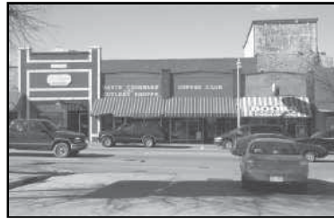
This central building has used pilasters and the shape of the parapet wall to divide a single facade into three vertically-oriented distinct bays which keep it in scale with neighboring buildings.