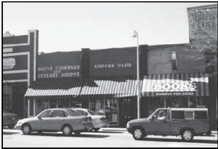
This building, located in Sub-District 1A, should serve as a model for future infill development.