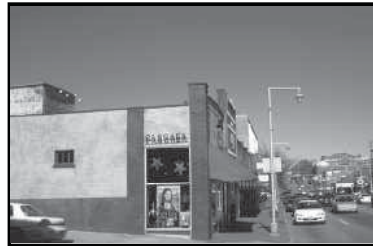
Flat roofs with parapet walls are the dominant form in the Village's commercial core.