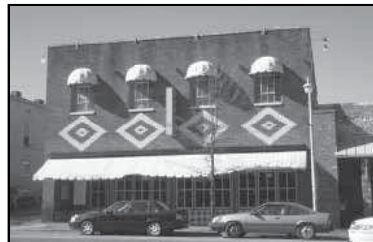
It is critical to the character of a building, as well as the maintenance of an animated street, that minimum levels of facade transparency be required.