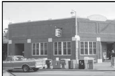
Decorative elements can be used to enhance brick, which should be the primary building material in the Village's commercial core.