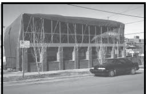
A wide variety of building types and designs characterize the commercial perimeter areas.