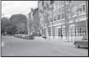
Although architecturally compatible with the Village in many ways, the 4-story scale of this building is inappropriate.