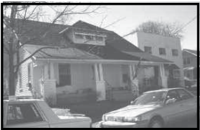
The residential buildings along the south side of Belcourt Avenue constitute a distinct and cohesive design character which contrasts with the north side of the street.