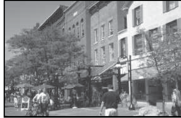
Buildings in Sub-districts 1A and 1C shall not exceed 3 stories in height.