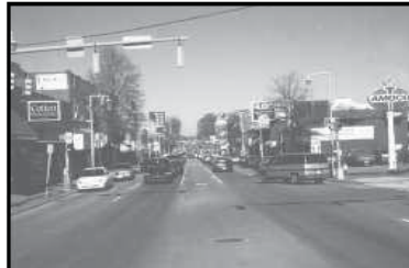
Within the commercial core of Hillsboro Village, buildings should frame the street and create an "outdoor room", which makes people feel comfortable and encourages pedestrian activity.