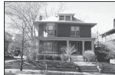
Depending upon the specific architectural style, residential structures tend to have at least 30% of their facade area comprised of window and door transparency.