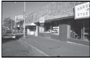
The false mansard roof in this image is too large for the building scale, inappropriate for the building's style, and obscures the building's facade.