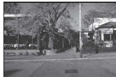
Buildings in the commercial perimeter sub-districts can utilize a wider range of materials than might be appropriate in other areas of the Village.