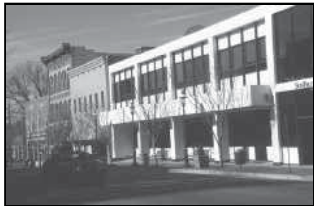
The color, materials and architectural detailing on the facade of this infill building are incompatible with the adjacent, older buildings.