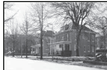
Although now used for offices, the Sub-district 2A portion of 21 st Avenue was originally developed with homes, and future development here must respect the established building setbacks.