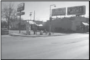
Deep highway strip building setbacks which use parking lots to detach buildings from their streets are inappropriate for older commercial areas.