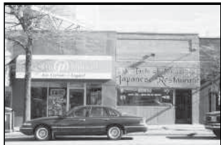
The building on the right has been altered by applying wooden panels to the base of the facade, thus obscuring the original brick.