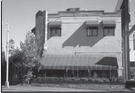
The Sportsman Grill is the only building identified as worthy of conservation in Sub-District 1C.