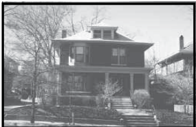
Now used primarily as offices, the residential buildings along 21st Avenue have maintained their architectural character.