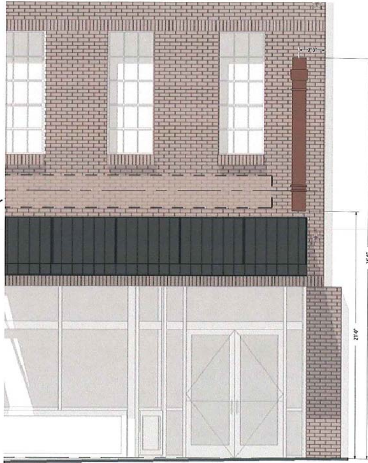
Location Elevation Details Scale: 1/4" = 1'-0"