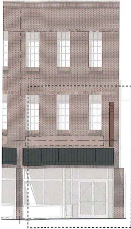
Location Elevation Scale: 1/8" = 1'-0"