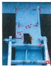
THE NASHVILLE CONNECTION 130 2ND AVENUE NORTH NASHVILLE, TN