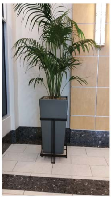
1 TYPICAL PLANTER IMAGE

© 15108 03251 Planting Schedule 100% Edition - Rev. 04