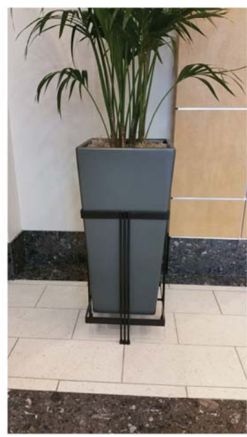
2 TYPICAL PLANTER IMAGE