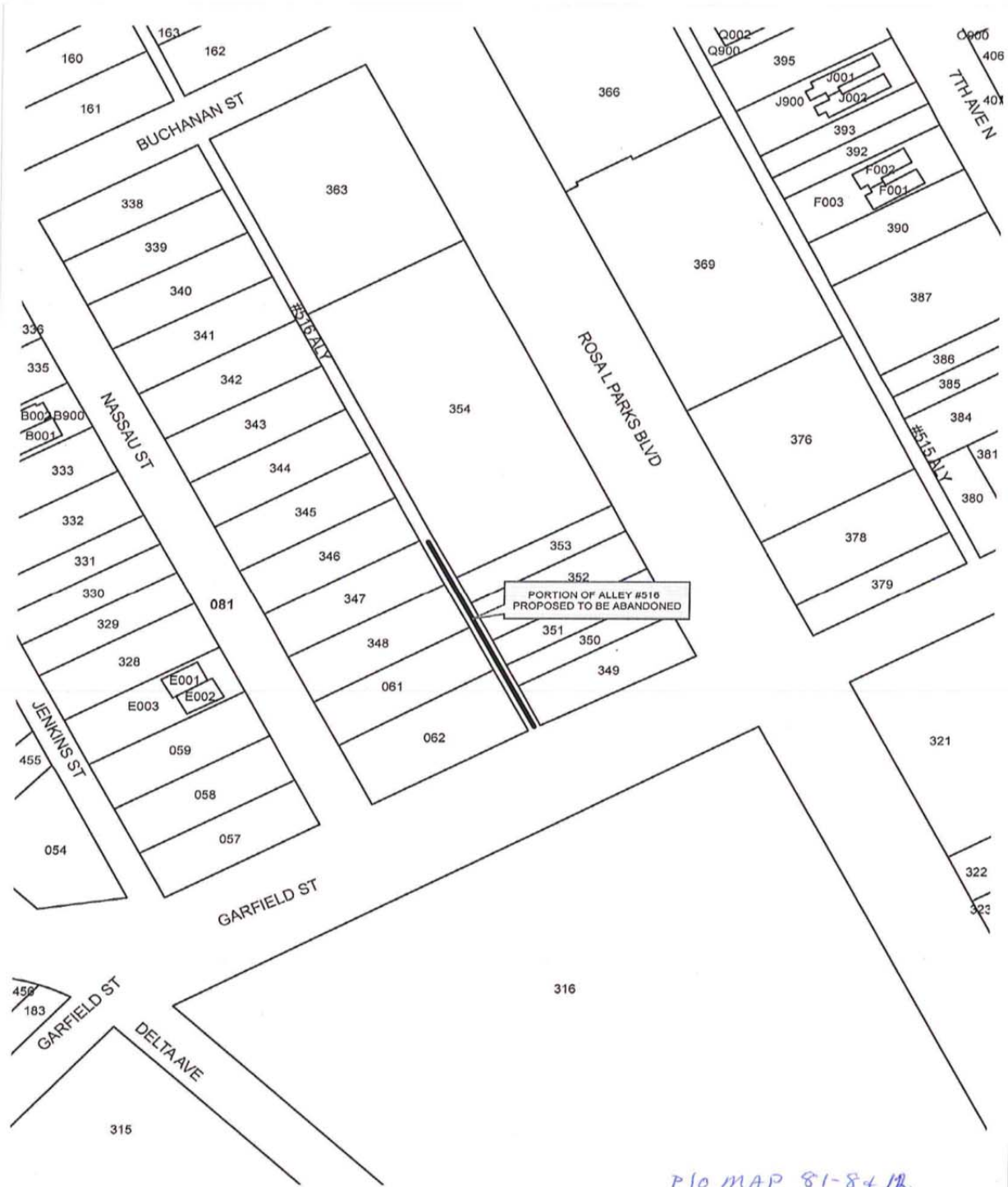
SKETCH SHOWING THE REROUTING OF THE ALLEY OUT TO NASSAU ST